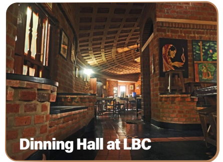
Dinning Hall at LBC