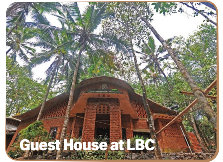
Guest House at LBC