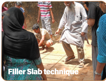
Filler Slab technique