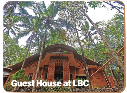
Guest House at LBC