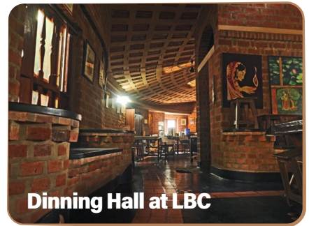
Dinning Hall at LBC